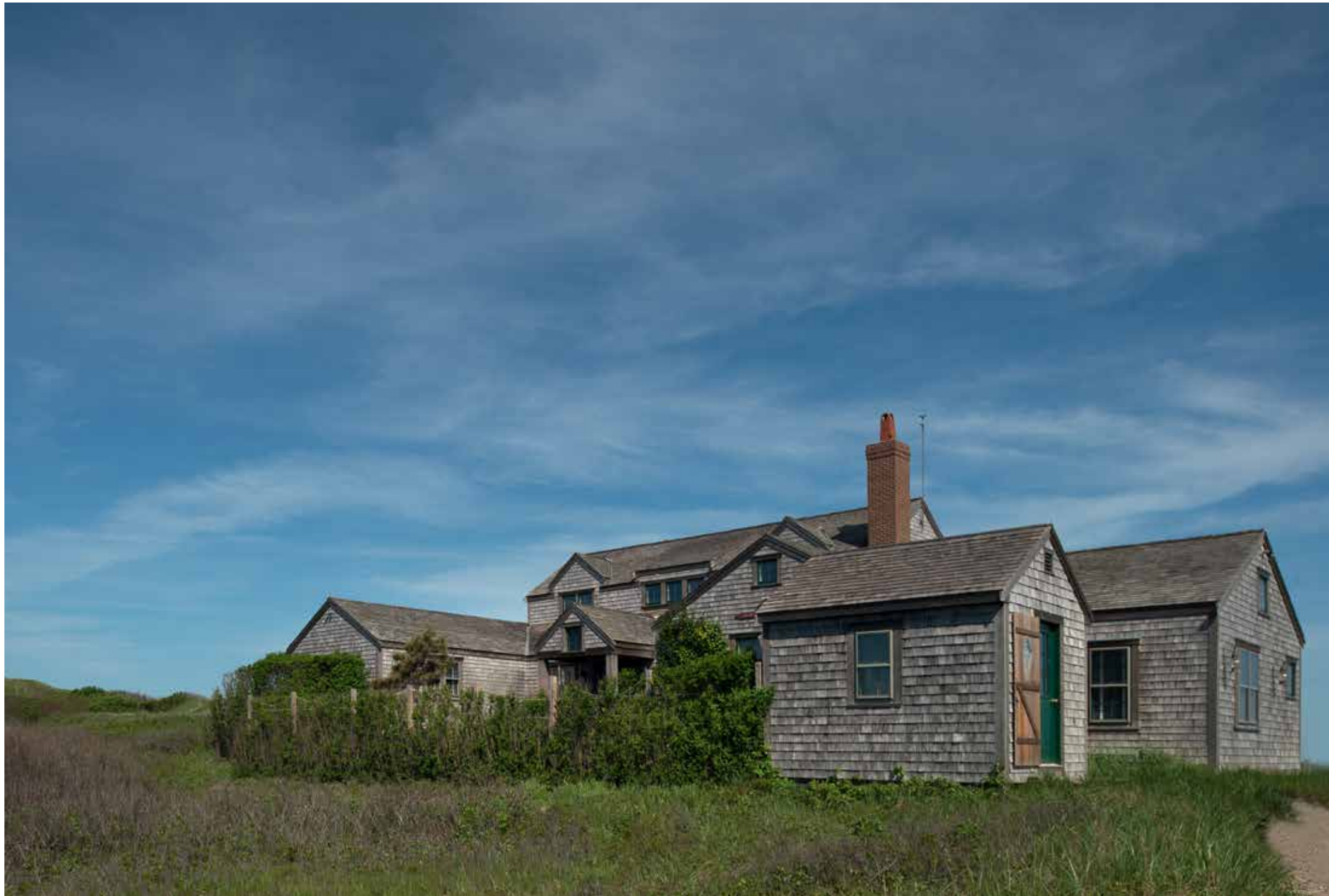
OPPOSITE: In the second-floor hallway, a slim sofa is oriented toward a band of French doors and windows that overlook the ocean. ABOVE: The home's weathered-shingle exterior is unassuming and rustic, reminiscent of a time gone by.