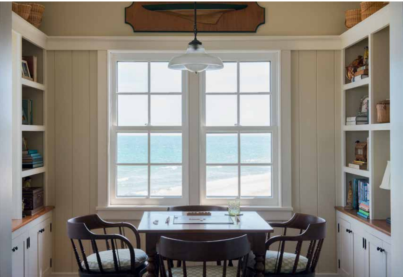
ABOVE: The homeowners enjoy playing games at the antique game table with their grandchildren on rainy days. OPPOSITE: Built-in shelves showcase the couple's cherished collectibles and books.